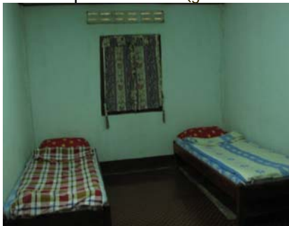
Basic guesthouse in Kiew Ka Cham

Kasi is another small town slightly more developed than Kiew Ka Cham. Accommodation is still basic, though better than the previous one (guesthouse with shower, twin-share)