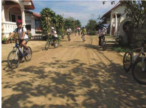
city tour through back streets and villages