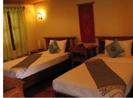
hotel rooms in Luang Prabang