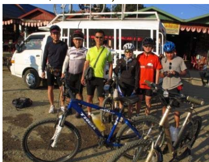
Our support vehicles and bikes