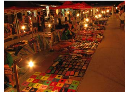
Night street market in Luang Prabang