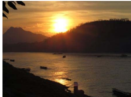
Sunset at Mekong River