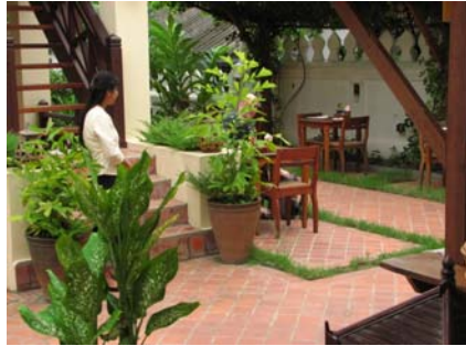
hotel in Luang Prabang

Connecting time: 0910, 1150 or 1630hrs. Pickup from airport, transfer for check-in to a boutique hotel. In the evening, take a walk up Phousi Hill to have a good view of the town and watch the sunset. After that, enjoy our specially selected traditional Laos dinner at a chic riverside restaurant bar (boutique hotel, twin-share)