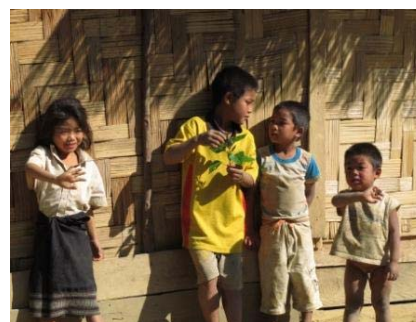
Laos children at the villages