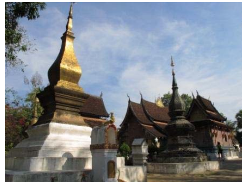
Ban Xieng Tong