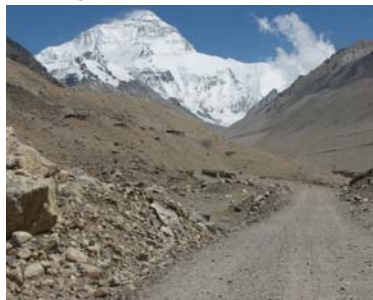
en-route up to Everest base camp