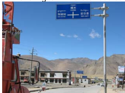
split-junction to ZhangMu